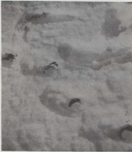
Frederic, Wis. tracks – see below