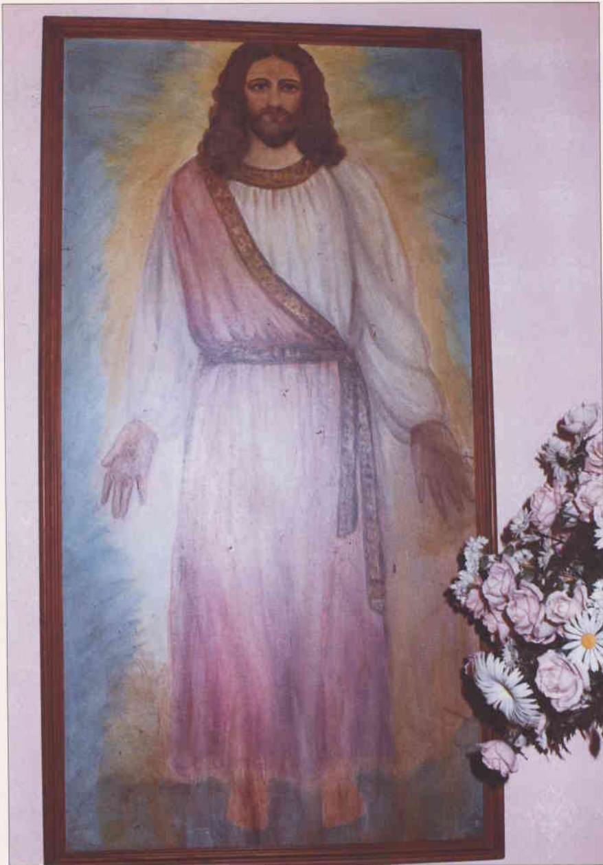
Portrait of Jesus (painted by G. Adamski)